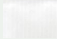
a: Mat white kraft paper